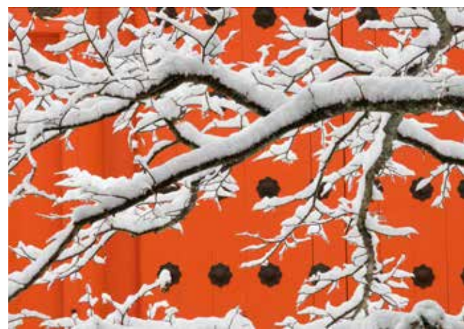
Snow-covered branches in front of a brightly coloured wall create a peaceful scene at the Koyasan Shingon Temples in Japan